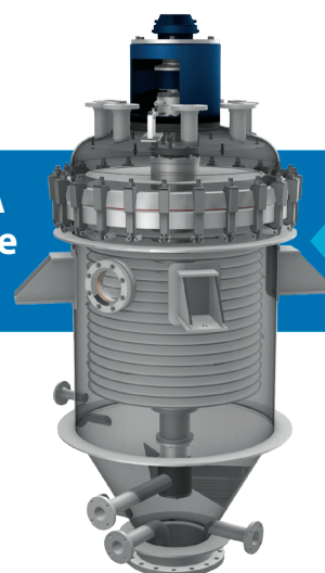
FUNDA Pressure Leaf