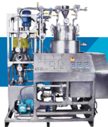
FUNDA Pressure Leaf