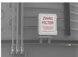
Junction Box on Unit

All Control Panel features such as Agitator up/down, forward/reverse, speed, interior lighting, and E-Stop, plus proximity switch indications, temperature and pressure transmitters, lights and more, can be pre-wired to a junction box. This provides one central location to make connections to your DCS easier. Once connected, the unit can be operated manually or automatically from the control room.