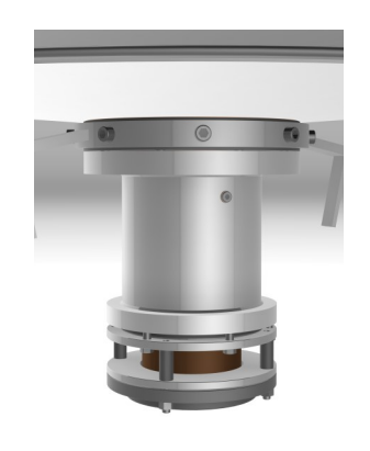
With PTFE Sleeve

The most commonly installed lower bearing consists of a bearing housing that is mounted onto the bottom end of the filter nest shaft, a PTFE sleeve that carries the radial loads of the bottom end of the filter shaft during rotation, and two lip seals that are installed in the bearing housing. Alternately the lower bearing can be configured with an additional bearing bushing, a large centering coin, or a PTFE sock for additional sealing at the spigot. Both of these styles have proven to be excellent performers over a wide range of applications.