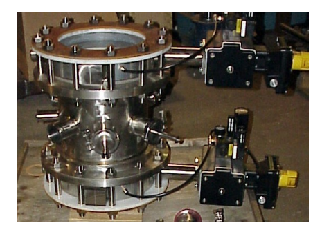
Double Butterfly with Flushing

When handling extremely hazardous materials, a double butterfly valve can be installed. This design results in zero leakage under any condition. Two butterfly valves are installed with a spool piece between them, creating an airlock condition. The spool piece is equipped with flushing, venting and drainage ports.