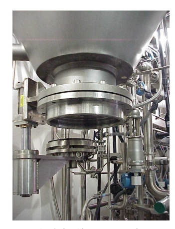
Quick Closure Valve

One pull of a handle completes the closure of the discharge valve. This hand operated locking device locks a dish in place using sliding segments that swing out as the handle is pulled. The segments engage with a groove inside the filter vessel. When the segments reach full engagement, a slightly ramped surface applies pressure to the o-ring seal. A optional proximity sensor can provide positive feedback that the quick closure is in the locked position.