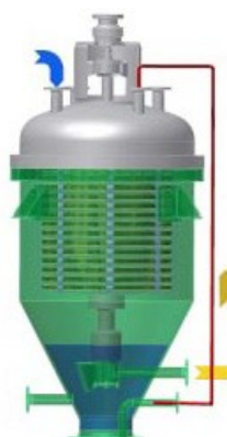
Cake Wash Method 2

The wash liquid follows the same route as in filtration. The wash liquid passes through the filter cake, filter screen and spacer ring area to the hollow shaft and filtrate outlet.