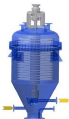
Cake Wash Method 1