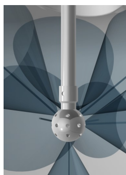
CIP 3D Modeling

Steri utilizes 3D computer modeling techniques to visualize spray patterns and verify coverage. To optimize CIP quality, spray angles, spray head types and spray head location patterns are modeled during the design phase. So even before we make the first weld on a new FUNDA filter, 100% complete spray pattern coverage is clear and certain.