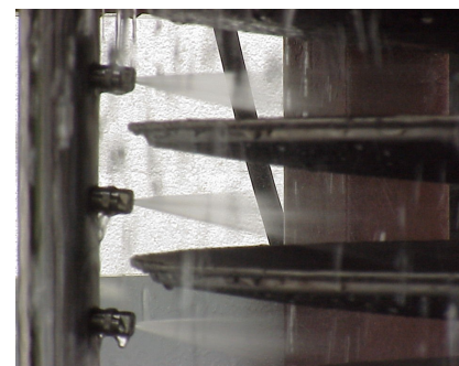
CIP Testing at Steri

First article testing can be performed using riboflavin to confirm total cleansing of all interior surfaces.