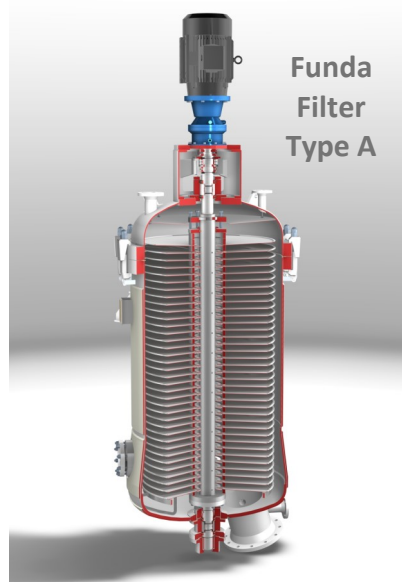
Funda Filter Type A

The most frequent use of such catalysts lies in reducing reactions, i.e. hydrogen is built into the molecule, a reaction widely used in organic synthesis.